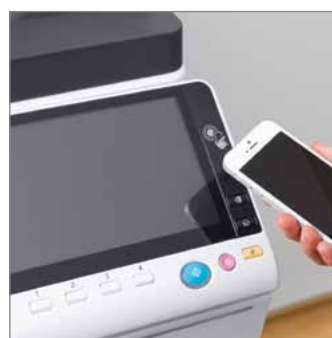
New area for Near Field Communication (NFC) Authentication