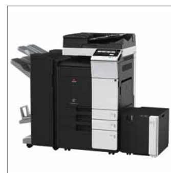
Configuration with FS-534SD Finisher, PC-410 Tray, LU-302 Large Capacity Tray, and DF-704 Document Feeder